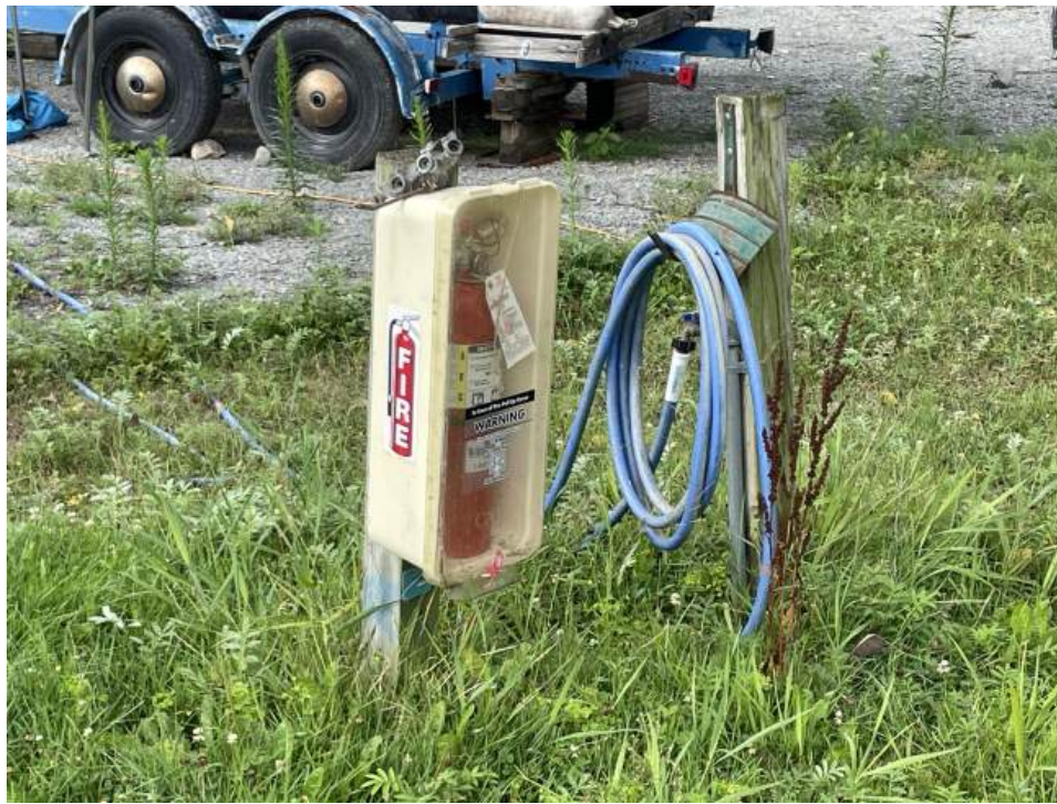
Outside Fire Extinguisher locations - Along North and South side of marina/dock area. Also located in land-storage areas.